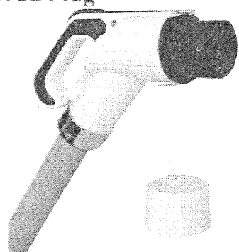
C1.2. EV Socket